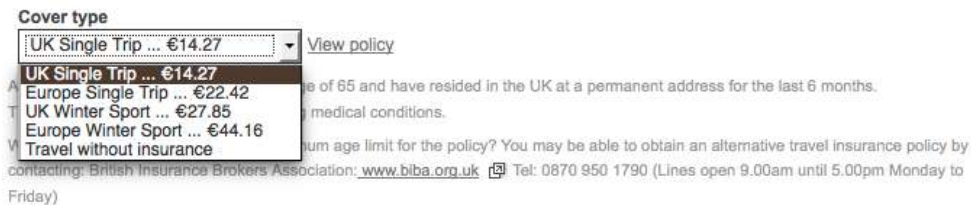
Figure 2. Screenshot of Flybe's insurance offer 34